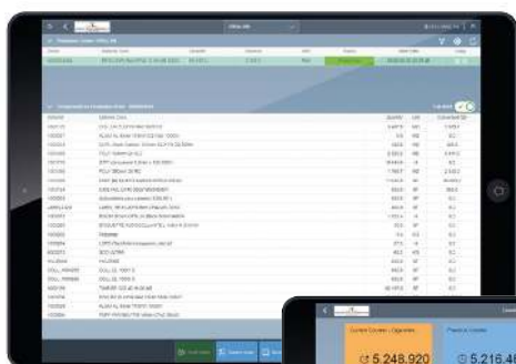
Order overview with status per workplace

With the help of Digital EXPERIENCE 2 , an innovative, agile Camelot approach for an accelerated digital transformation, solutions were ideated and validated jointly with the client. The results were then transformed into a testable prototype. Subsequently, the prototype was validated and implemented with the Industrial IoT solution SAP Manufacturing Integration & Intelligence (MII), including integration of SAP ECC, SAP EWM, labeling, shop floor and mobile devices as well as user interface simplification.